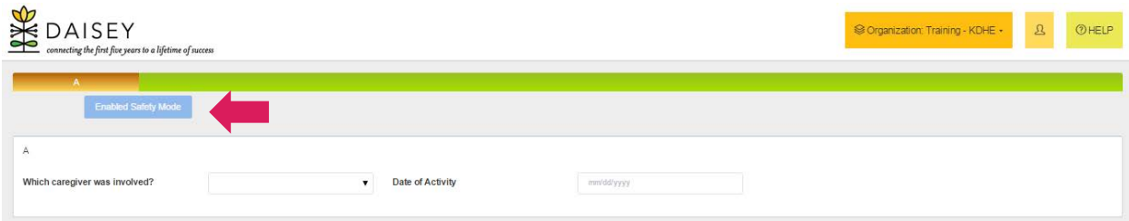
Figure 3: Safety mode enabled

Once safety mode is clicked, you will see a blue box near the top of the form (Figure 3). The form can now be filled out by a client. Once the form is submitted, the user is logged out of DAISEY. No other data or forms can be accessed by the client filling out the form.